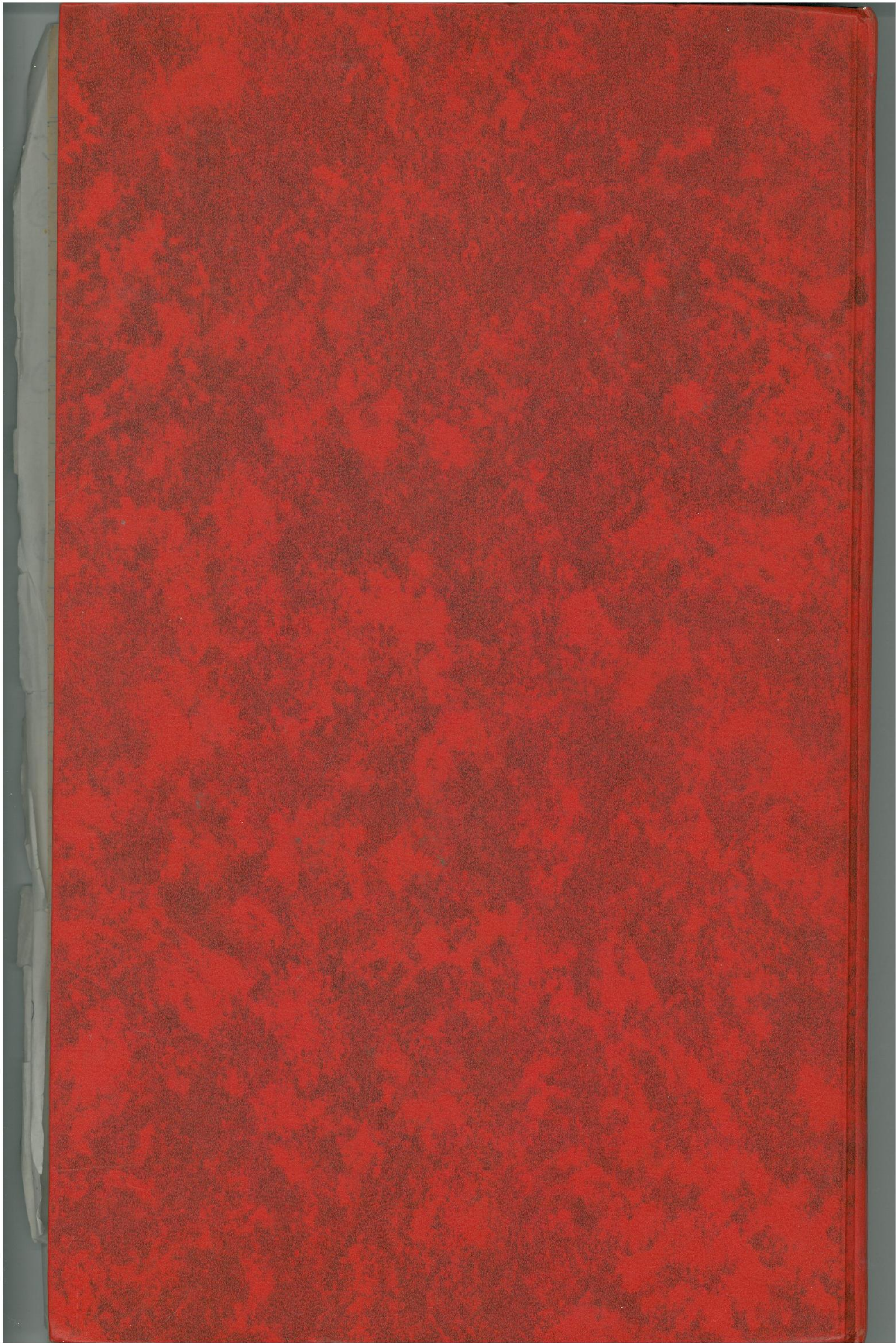
Collection: Tasmanian Museum and Art Gallery, R2016.2.2